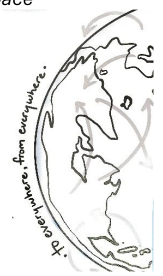
From Everywhere To Everywhere

Article* - Lausanne: Polycentric Missions