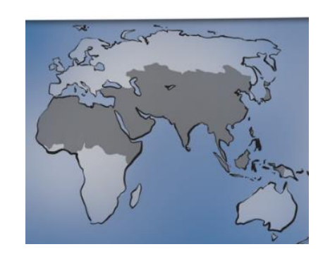
The 10/40 Window

Some pictures and missionaries in this section don't correspond perfectly to the dates because of lack of space